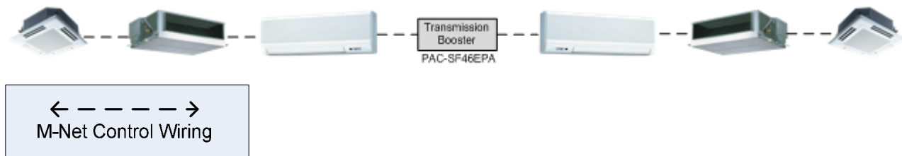
Figure 3: Unit configuration using Transmission Booster

The transmission booster is supported by Diamond System Builder. We recommend using the Diamond System Builder to assist with applying the transmission booster.