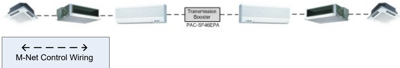
Figure 3: Unit configuration using Transmission Booster

The transmission booster is supported by Diamond System Builder. We recommend using the Diamond System Builder to assist with applying the transmission booster.