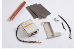
PAC-BH01KTT-E (Relay Box)