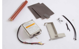
PAC-BH01KTT-E (Relay Box)