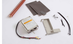
PAC-BH01KTT-E (Relay Box)